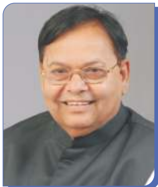
Hon'ble Dr. Patangrao Kadam